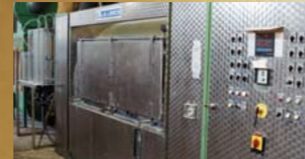
Washing for feathers and down