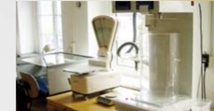
View of the laboratory