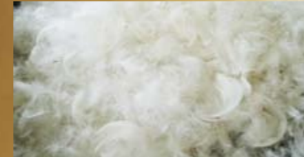
Raw feathers and down