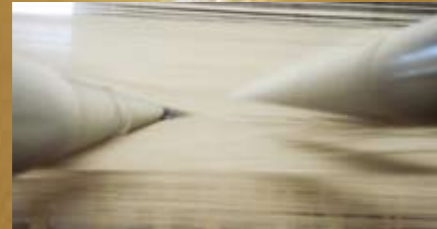
Sizing machine, splitting rods