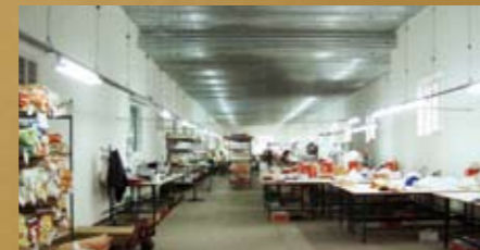
View of sewing plant