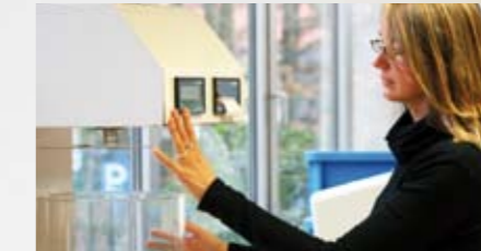
Measuring of filling power