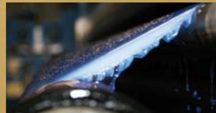
After washing, the fabric is dyed