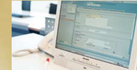
SAP supply chain management