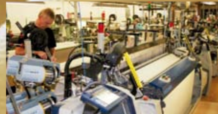
Set-up of automatic loom