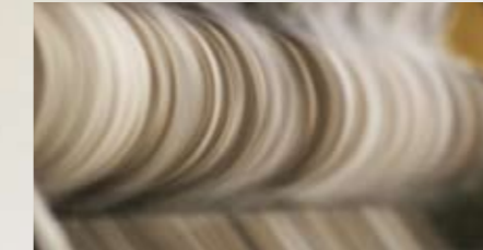
Manufacture of fleece