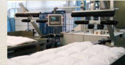
Computer-controlled filling machine